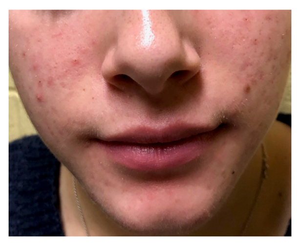
Figure 1. Moderate, mixed inflammatory and comedonal acne.

There is not necessarily a common starting point for all patients with the same presentation of acne. Selection of a treatment plan needs to include factors such as the mechanism of action of medication, the extent of acne, the morphology of acne, tolerance of medications, compliance