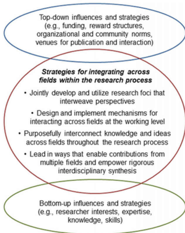
Fig 1. Diagram depicting the important role of interdisciplinary integration within the research process and several strategies that researchers can implement to build successful integration across fields.

This diagram depicts ‘the important role of interdisciplinary integration within the research process and several strategies that researchers can implement to build successful integration across fields.’ [15]