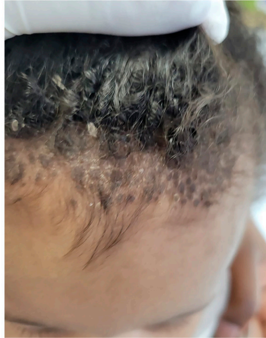
Figure 4A and B. Seborrheic dermatitis on the scalp.

infections. In the case of staphylococcal or streptococcal infection, infection is confirmed with culture, and Gram-stain of a skin lesion may reveal gram-positive cocci in clusters and the presence of neutrophils. Treatment is the administration of empiric antibiotics. (2)(23) In addition, one can consider less common etiologies such as psoriasis (ie, “napkin dermatitis”), histiocytosis, or Leiner disease (C5 component deficiency), which may require a biopsy for diagnosis. (24)