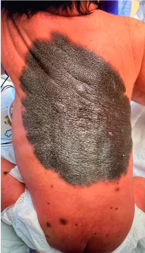
Figure 10A. Giant congenital nevus with satellite lesions.