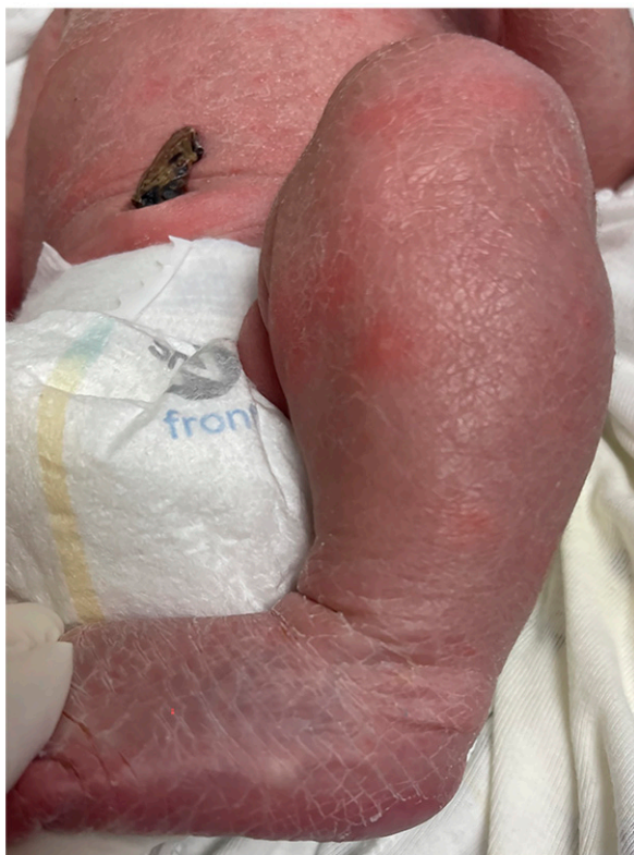
Figure 1B. Neonatal desquamation with concurrent ETN; ETN on the left leg.