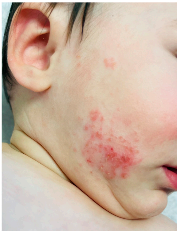
Figure 5. Atopic dermatitis on the right jawline and cheek.

Atopic dermatitis is a chronic inflammatory skin condition that is caused by a breakdown of the barrier function of the skin via mutation in the filaggrin protein. (26) More than 20% of children have atopic dermatitis, with more than 60% of cases presenting within the first 2 years of age. Atopic dermatitis presents as pruritic erythematous patches and plaques with resulting excoriation and/or lichenification commonly in the flexural surfaces (ie, antecubital or popliteal fossa) or the cheeks in infants (Fig 5). (27) Atopic dermatitis is highly associated with asthma, and often a history of asthma or atopic dermatitis in a first-degree relative is identified. (27) In addition, peripheral eosinophilia or immunoglobulin E reactivity may be seen. Treatment of atopic dermatitis is aimed at restoring the barrier function of the skin by using emollients or moisturizers (eg, petrolatum) and reducing inflammation with topical steroids