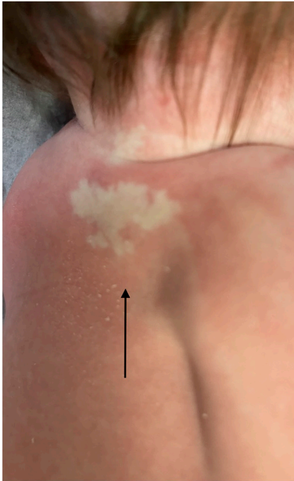
Figure 10C. Nevus anemicus on the right upper back.

for lesions close to the eyelid. The treatment of choice is laser therapy with pulsed dye laser. Less commonly, in recalcitrant cases, the alexandrite or Nd:YAG laser can be considered. Novel treatment options such as angiogenesis inhibitors are being explored. (57) Certain clinical features may point to more serious underlying disease. Historically, distribution of a PWB over the V 1 dermatome (ophthalmic division of the trigeminal nerve) was thought to be an indicator of Sturge-Weber syndrome. (56)(58) Researchers have recently shown that PWB segmental distribution is attributed to embryologic vasculature, not the trigeminal nerve distribution, and that any lesion on the forehead is more predictive of underlying Sturge-Weber syndrome, warranting further evaluation with ophthalmologic examination and brain magnetic resonance imaging. (59) Size of the PWB has also been associated with severity of neurologic involvement, which