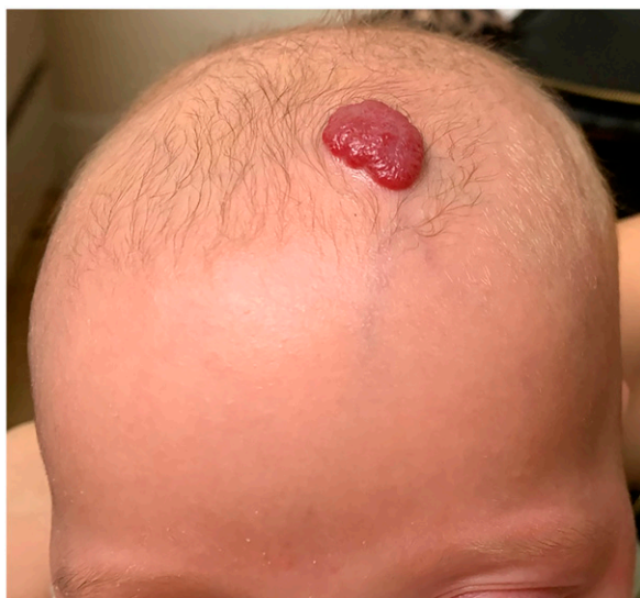
Figure 13C. Progression of infantile hemangioma; infantile hemangioma on the left upper anterior scalp.

lesion raises concern for hearing impairment or genitourinary defects in newborns. Treatment for preauricular pits, tags, and cysts includes surgical removal; in cases of recurrent infections, removal of the entire preauricular sinus tract is performed. The overall incidence rate is 0.1% to 0.9% in the United States, 0.9% in England, 1.6% to 2.5% in Taiwan, and 4% to 10% in some areas of Africa. (66) The prevalence of preauricular sinuses is higher in Black and Asian populations.