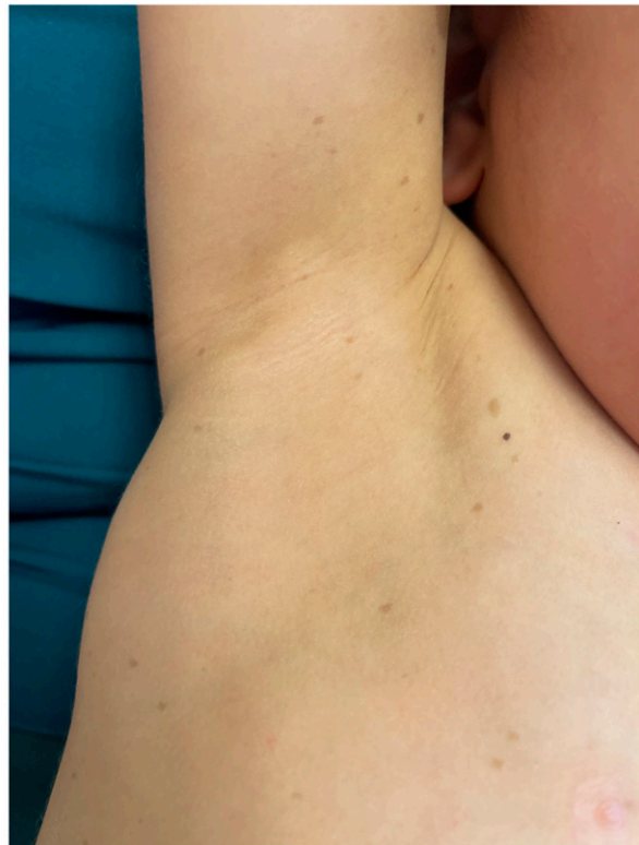
Figure 9. A. Multiple CALMs on the right flank with hypertrichotic patch. B. Right axilla demonstrating axillary freckling, concerning for an associated genodermatosis. CALM=café-au-lait macule.