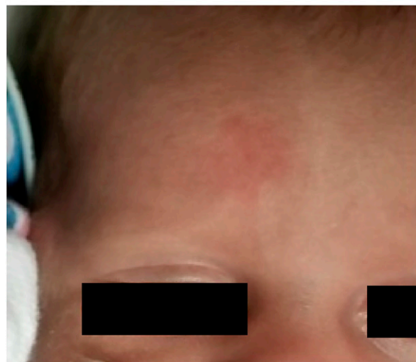
Figure 13A. Progression of infantile hemangioma; one week.