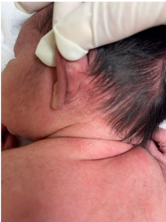
Figure 6. Miliaria seen on left posterior auricular scalp.

Epstein pearls are extremely common benign oral mucosal lesions found in ~60% to ~85% of newborns. Epstein pearls are thought to be caused by keratin entrapment