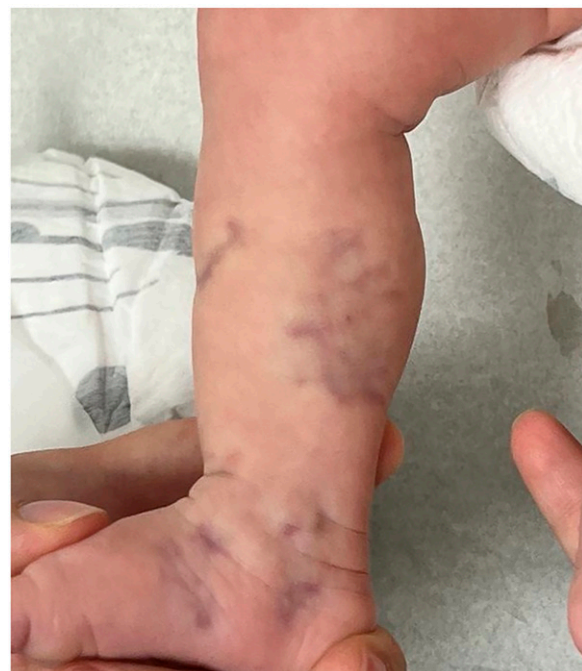
Figure 2C. CMTC on the right medial lower extremity.