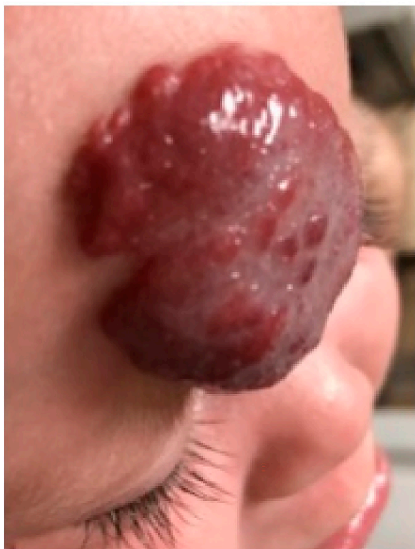
Figure 13B. Progression of infantile hemangioma; fully formed at 1 month.

due to improper fusion of the tubercles of the first 2 branchial arches, accessory skin tags that may require surgical removal, and ulcerations and infections. A preauricular