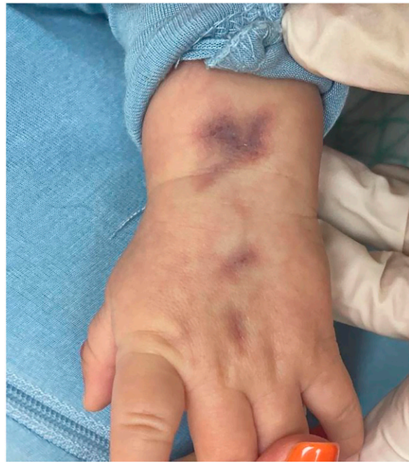
Figure 2B. CMTC on the left dorsal hand and wrist. CMTC=cutis marmorata telangiectatica congenita.

confirm a benign cause. Benign pustular dermatoses are differentiated from HSV infection by the absence of multinucleated giant cells on Wright stain or Tzanck smear.