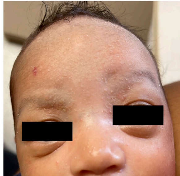
Figure 4C. Seborrheic dermatitis extending onto the forehead.