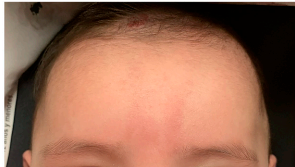
Figure 11. A. Nevus simplex on the posterior lower scalp/nape. B. Nevus simplex on the glabella.

ACC is less than 10 cm in diameter and has a variety of features, including a circular, oval, linear, or stellate membranous or nonmembranous surface. Lesions larger than 10 cm are typically associated with underlying bony defects, which is important in considering complications that may result in death. Presence of ACC may be associated with complications including infection, hemorrhage, thrombosis, and seizures. In