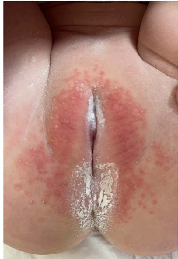
Figure 3. Candidal diaper dermatitis on the female newborn genitalia.

Superimposed infection can arise as a complication of irritant contact dermatitis, typically within 48 to 72 hours, and may lead to recalcitrant diaper dermatitis, requiring further evaluation and alternative management. Candidal infection, followed by staphylococcal infection, is the most common infectious etiology. Involvement of the perineum or the presence of satellite lesions (separate and distinct round erythematous patches or plaques) may signal candidal infection (Fig 3). Candida albicans has been isolated from 80% of diaper dermatitis with perineal involvement. Erythematous beefiness of the anal area may indicate a