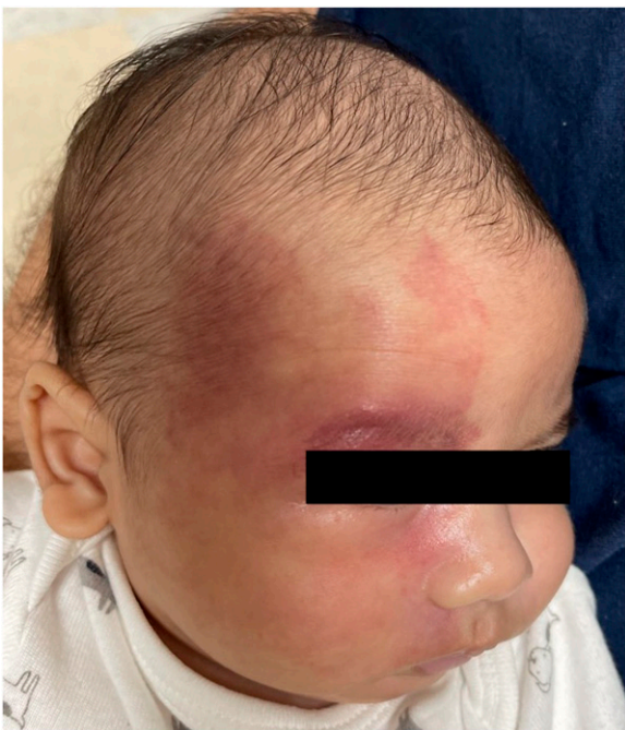
Figure 12. Port-wine stain (nevus flammeus) on the right half of face with concern for possible Sturge-Weber syndrome.

A preauricular sinus is an isolated congenital defect associated with the squamous epithelium that lines the sinus in front of the ear. This defect can lead to the production of epithelial-lined subcutaneous cysts, preauricular pits