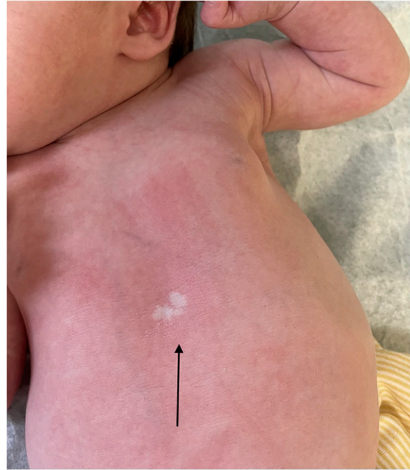
Figure 10B. Nevus anemicus on the mid-chest.

crying, vigorous activity, and ambient temperature changes and blanches with compression. Most often, a nevus simplex fades spontaneously within 1 to 2 years after birth; however, lesions on the nape and glabella are more likely to persist into adulthood. Unusually prominent or persistent nevus simplex has been associated with underlying conditions including Beckwith-Wiedemann syndrome, macrocephaly-capillary malformation, odontodysplasia, and Roberts–SC phocomelia syndrome. A benign nevus simplex requires no further evaluation or treatment. (54)(55)