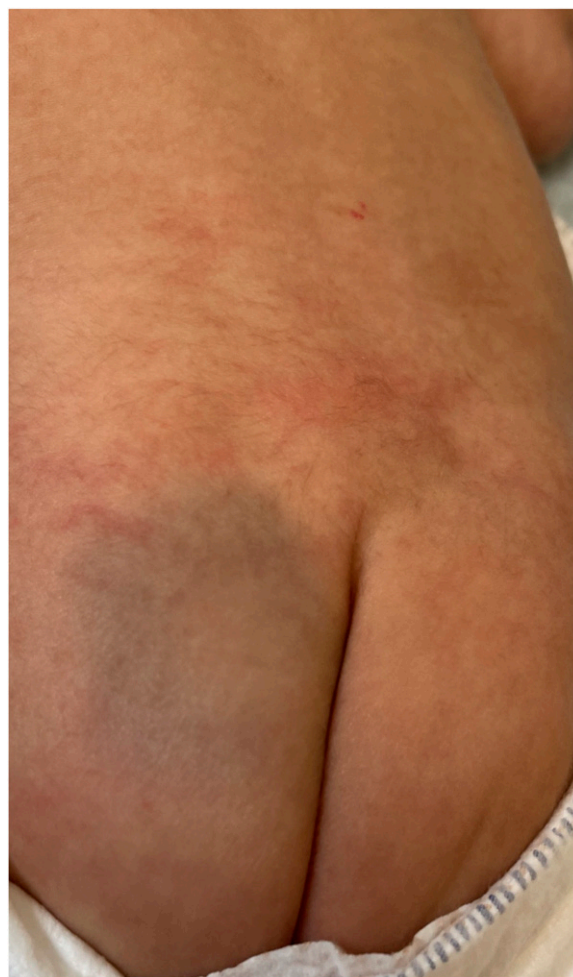
Figure 8. Congenital dermal melanocytosis on the right buttock.

Congenital dermal melanocytosis (CDM), previously referred to as Mongolian patch, is a common, benign newborn finding that presents as gray-blue macules and/or patches (Fig 8).