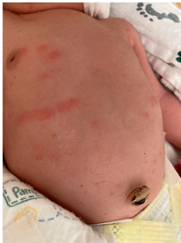
Figure 1C. Neonatal desquamation with concurrent ETN; NTN on the trunk.

that evolve into a central desquamating crust. A secondary hyperpigmented macule with a collarette of fine scale may persist several days after. At times, the hyperpigmented macule with collarette of scale is the only presentation at birth. TNPM commonly involves the chin, neck, upper chest, sacrum, abdomen, and thighs and spares acral surfaces. Diagnosis is made clinically, although a Wright stain or Tzanck smear of a lesion revealing numerous neutrophils and rare eosinophils is confirmatory and can help to quickly and easily rule out HSV. Lesions typically self-resolve within the first 2 weeks after birth, and treatment is not necessary. (2)(6)(17)