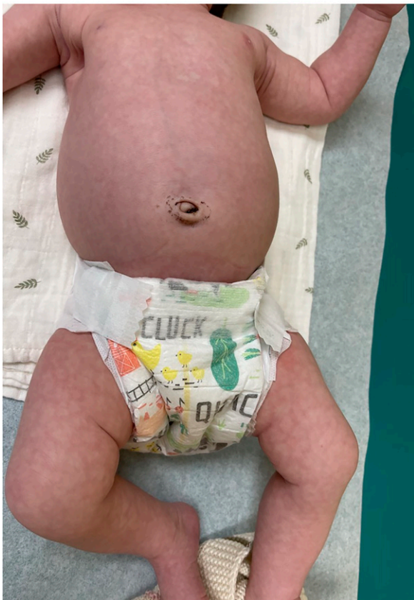
Figure 2A. Cutis marmorata diffusely on the trunk and upper and lower extremities.