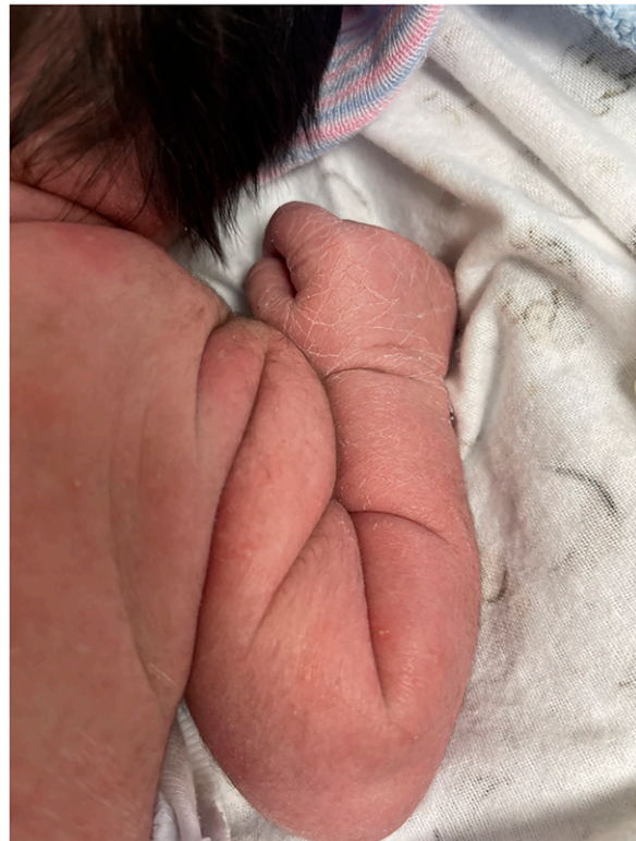
Figure 1A. Neonatal desquamation with concurrent ETN; ETN on the right arm and back. ETN=erythema toxicum neonatorum.