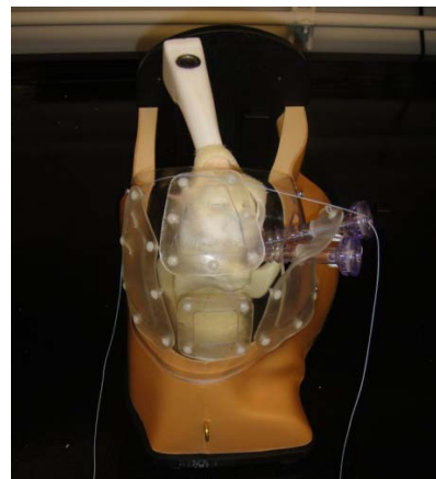
Knee arthroscopy simulator.